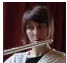
Detta Danford Bass Flute